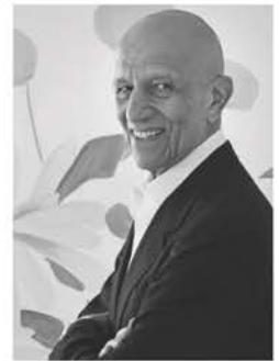
White Roses 9 , 2012, at the High Museum of Art; the artist, above

self, as well as an affinity for the surrounding area. He eventually purchased a house in Lincolnville.