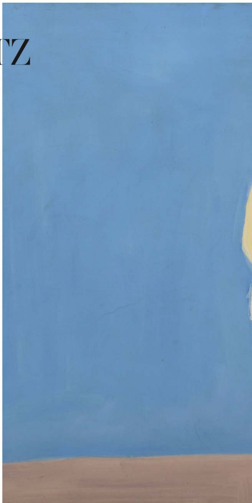
Bather, 1959, at the Colby College Museum of Art

The artist's profound connection and devotion to the state of Maine—where he escapes each summer—and Colby, began at the Skowhegan School of Painting & Sculpture. Katz received a scholarship in 1949 venturing outdoors to paint al fresco. While at Skowhegan, he had an epiphany and discovered a connection between the painting process and his unconscious