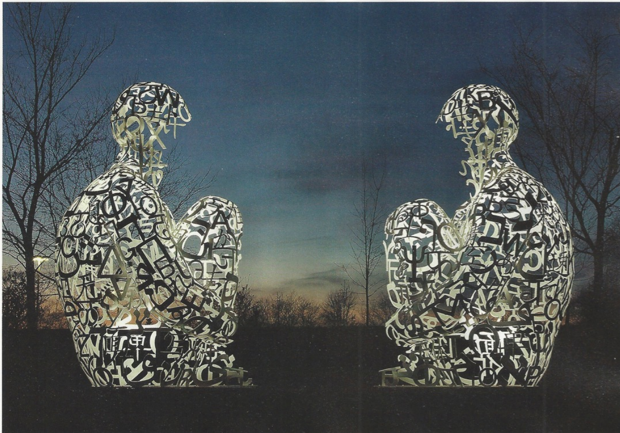
Jaume Plensa, Spiegel , 2010, painted stainless steel, 148 ½ inches x 92 ½ inches.

A TRAVELING EXHIBITION SHOWCASES SPANISH ARTIST JAUME PLENSA'S SCULPTURE AND DRAWINGS. BY JOHN DORFMAN