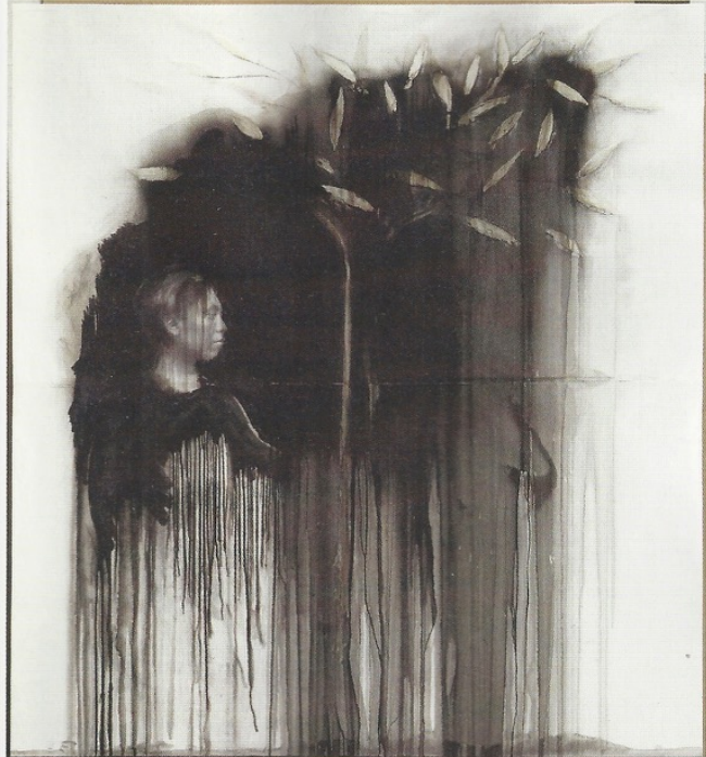
Clockwise from top left: Slumberland VI , 2014, graphite on paper, 57 x 45 inches; Paisatge VII , 2009, mixed media, 87 x 79 inches; Laura with Bun , 2014, cast iron, 277 x 39 x 122 inches, installation view: Cheekwood Botanical Garden & Museum of Art, Nashville, 2015.