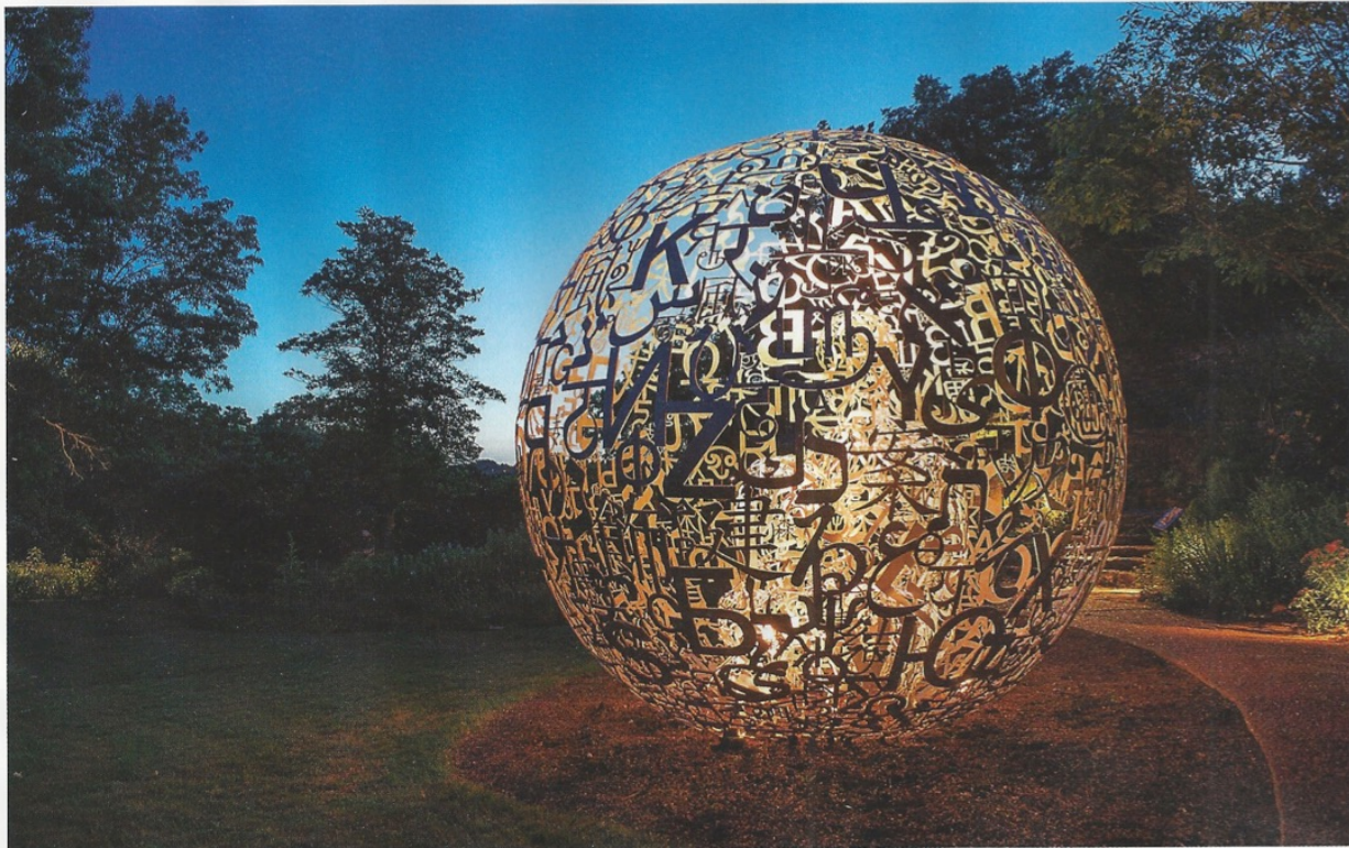
From top: Self Portrait , 2013, stainless steel, 128 x 138 x 138 inches each, installation view: Cheekwood Botanical Garden & Museum of Art, Nashville, 2015; See No Evil, Hear No Evil, Speak No Evil , 2010, polyester resin, stainless steel and LED light, 48 x 58 x 81 inches each installation view: Frist Center for the Arts, 2015.

more. "Each letter is a possibility," Plensa has said. "After a long period using quotes and sentences from poets, I decided to work only with letters and alphabets: the most biological part of the text, it means the letter as a 'cell.'" Here, the combination of letters represents the Babel of world languages reunited, as a symbol of world unity.