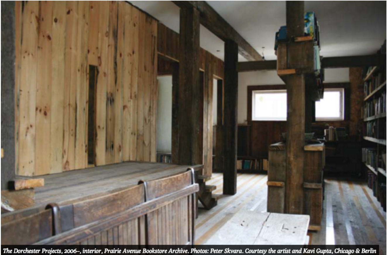
The Dorchester Projects, 2006–, interior, Prairie Avenue Bookstore Archive.

that need but can't possibly afford culture today provide contemporary art with something it's been sorely lacking: purpose.