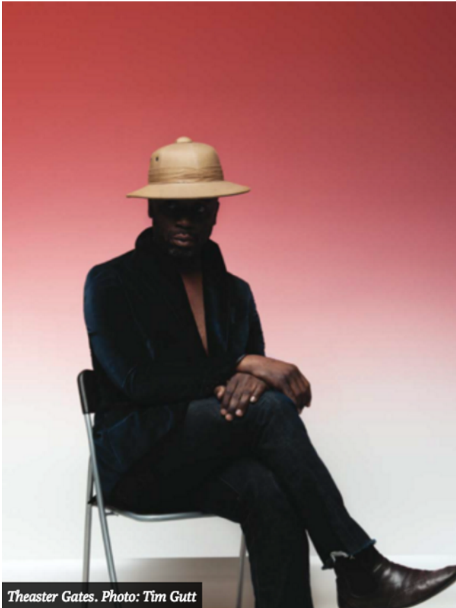
Theaster Gates.

‘I’M NOT A SOCIAL WORKER. I DID STUDY URBAN PLANNING BECAUSE I KNEW THAT CITIES HAD PROBLEMS, AND BLACK PEOPLE IN CITIES WERE CONSIDERED THE PROBLEM’