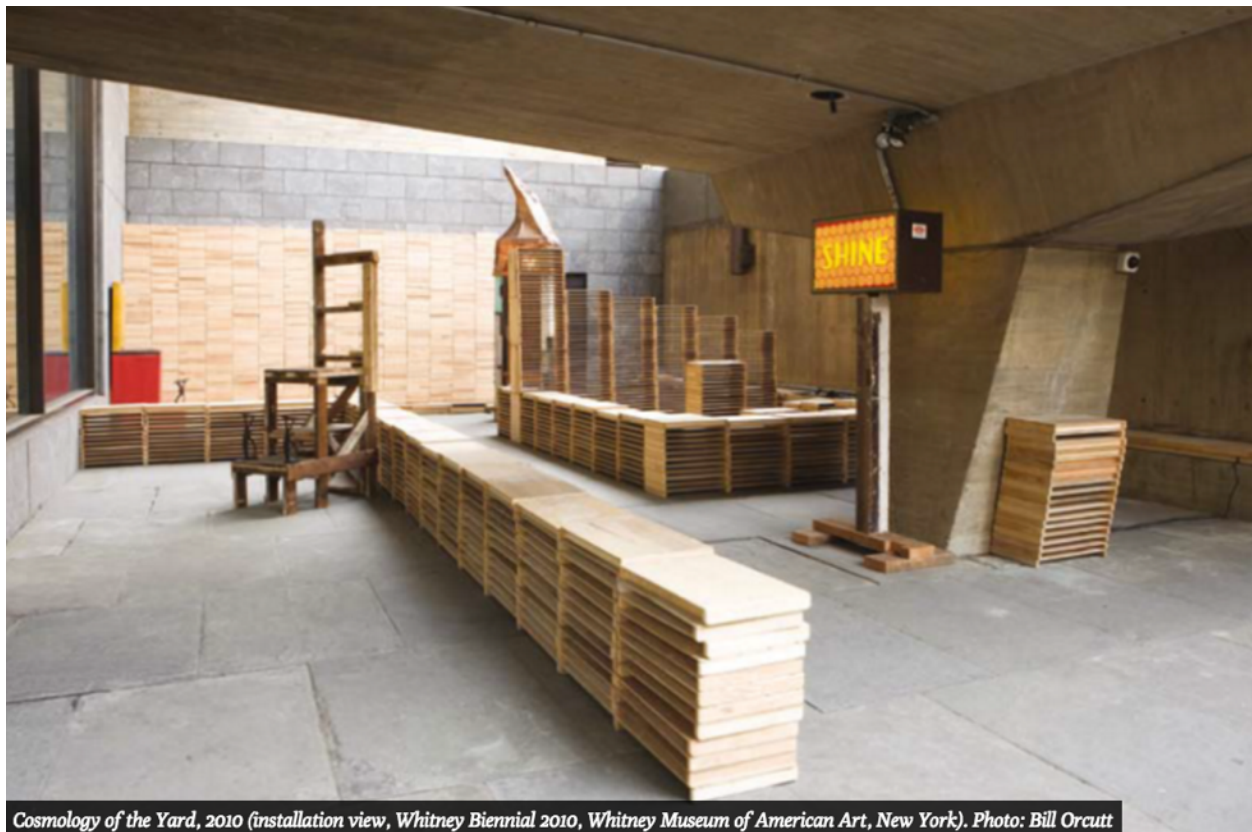
Cosmology of the Yard, 2010 (installation view, Whitney Biennial 2010, Whitney Museum of American Art, New York).

Jobs followed that at once expanded and concentrated Gates’s eclectic resumé. He worked as an urbanist in Seattle for a Christian mission that ran a housing programme in poor neighbourhoods. He ran an arts education nonprofit centre, Little Black Pearl, in Chicago’s black community. He slogged as an arts planner for the Chicago Transit Authority, a position he found bureaucratic and limiting. Eventually Gates settled into a job at the University of Chicago as a coordinator of arts programming – all the while developing a wide-ranging practice that lassoed his disparate interests into what Republican hacks might call, in keeping with the bigoted derision aimed at America’s 44th President, ‘community organising’.